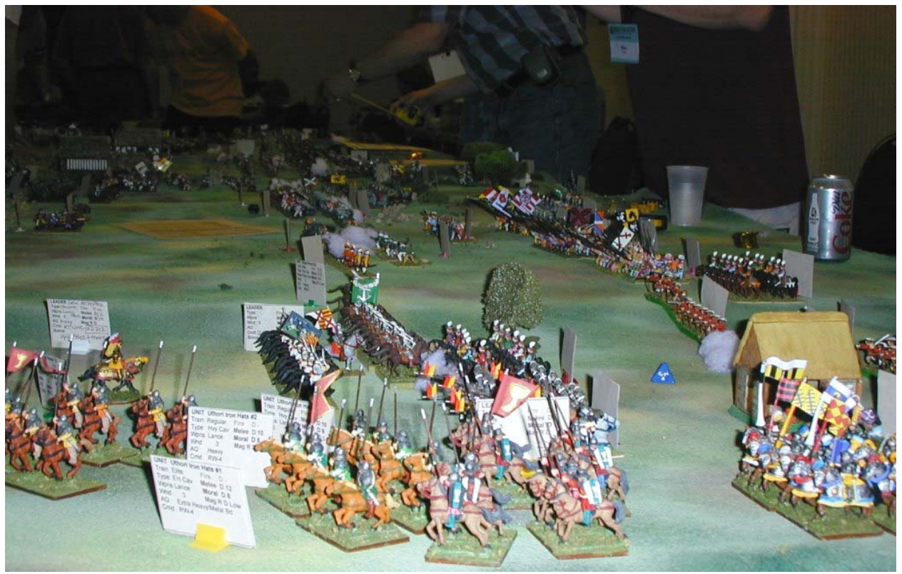
Before long, they had soundly trounced the troops of Hos Hostigos, there being none of the crack Royal Infantry to hold it all together. That left the center...