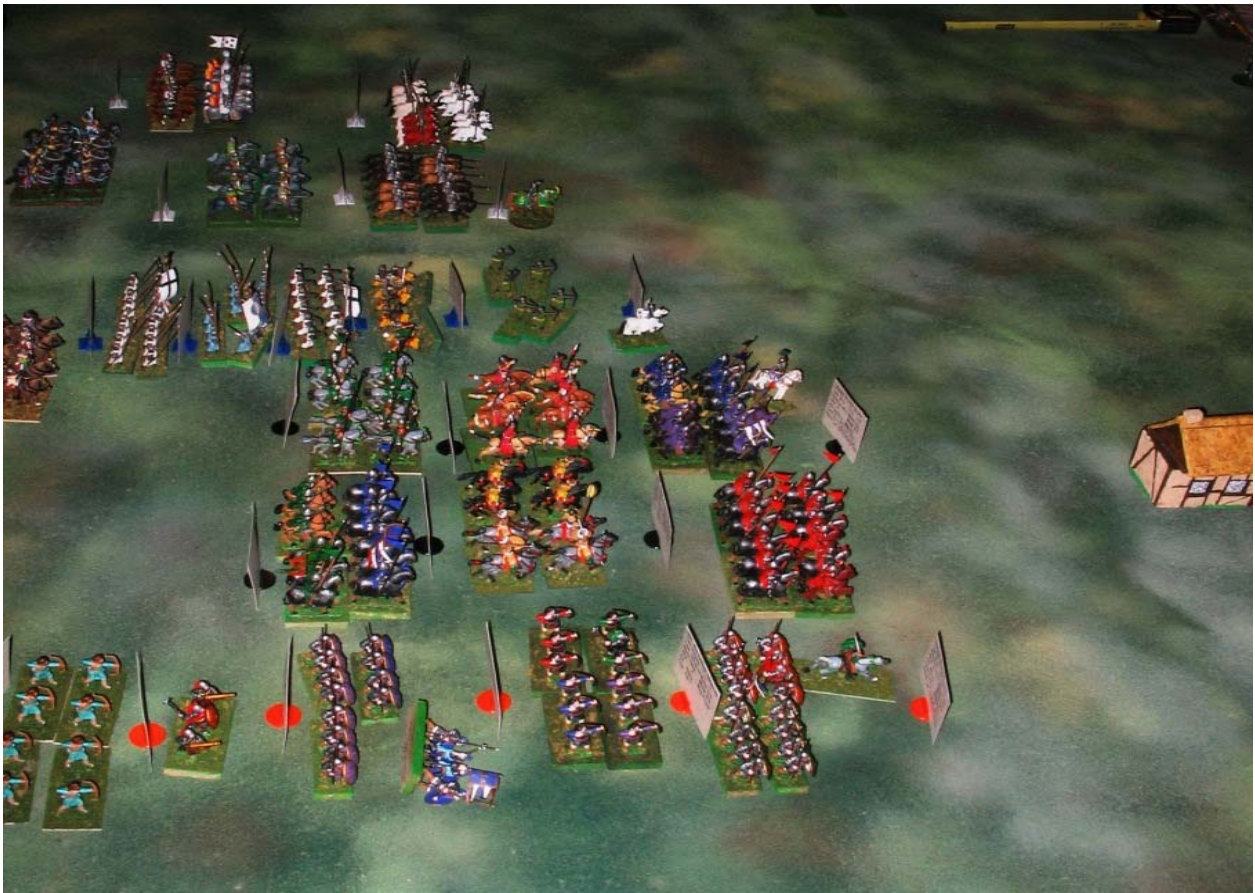
View of the Right wing of the Grand Host of Styphon