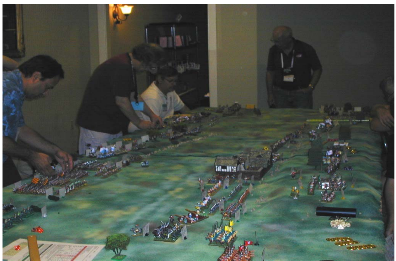
Here is a long view of the table, with the Styphoni Left flank also completing final deployment. The walled Villa to the front of Kalvan's line is fortified and crammed with heavy guns, destined